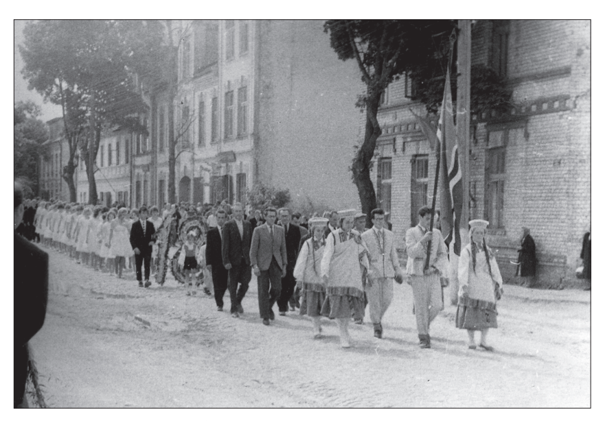
Figure 3. The Festivity of Majority in the Council of Berze Village in 1964. E 28 10236.