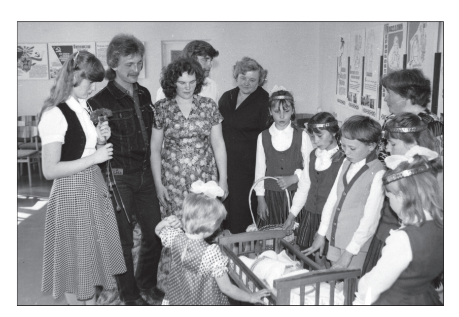
Figure 1. Issuing the birth certificate in the district of Daugavpils / Krāslava in 1983. E 57 156.

Long debates and numerous pilot projects introduced the Festivity of Childhood<sup>50</sup> (see Figure 2) – the initiating ritual of a child into a collective – and ensured that this festivity became an integral part of the agenda of the local executive authorities. The next cycle of life in the system of invented Soviet traditions was the Festivity of Majority (see Figure 3), whose origins can already be observed in the Latvian SSR in the mid-1950s. It had to become an alternative for the Christening of the Lutheran Church. In the 1960s, as attested by the materials of the REM, the Festivity of Majority was celebrated in the entire territory of the Latvian SSR. The ritual of this festivity included the following elements: a pre-festive cycle of seminars, procession to the local Lenin