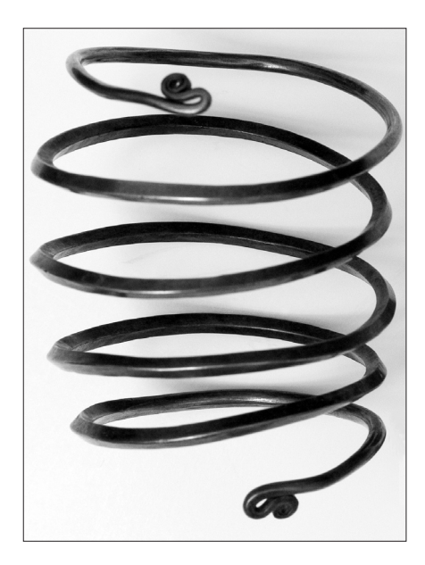
Fig. 3. Money ring ('osering'?) from the hoard of Ääsmäe, Estonia. Weight 96.9 g. Estonian History Museum, AM 13749/ A70.

a term that belongs to the oldest (referring to the years 400–800) and most primitive stage of money use ( Nutzgeld ), which is bridged by centuries from references to osering . Moreover, the combining of Baltic and Scandinavian roots seems odd, albeit not impossible, in the case of this explanation.